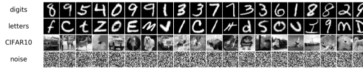
Fig. 1. Different concepts used for our statistical experiments